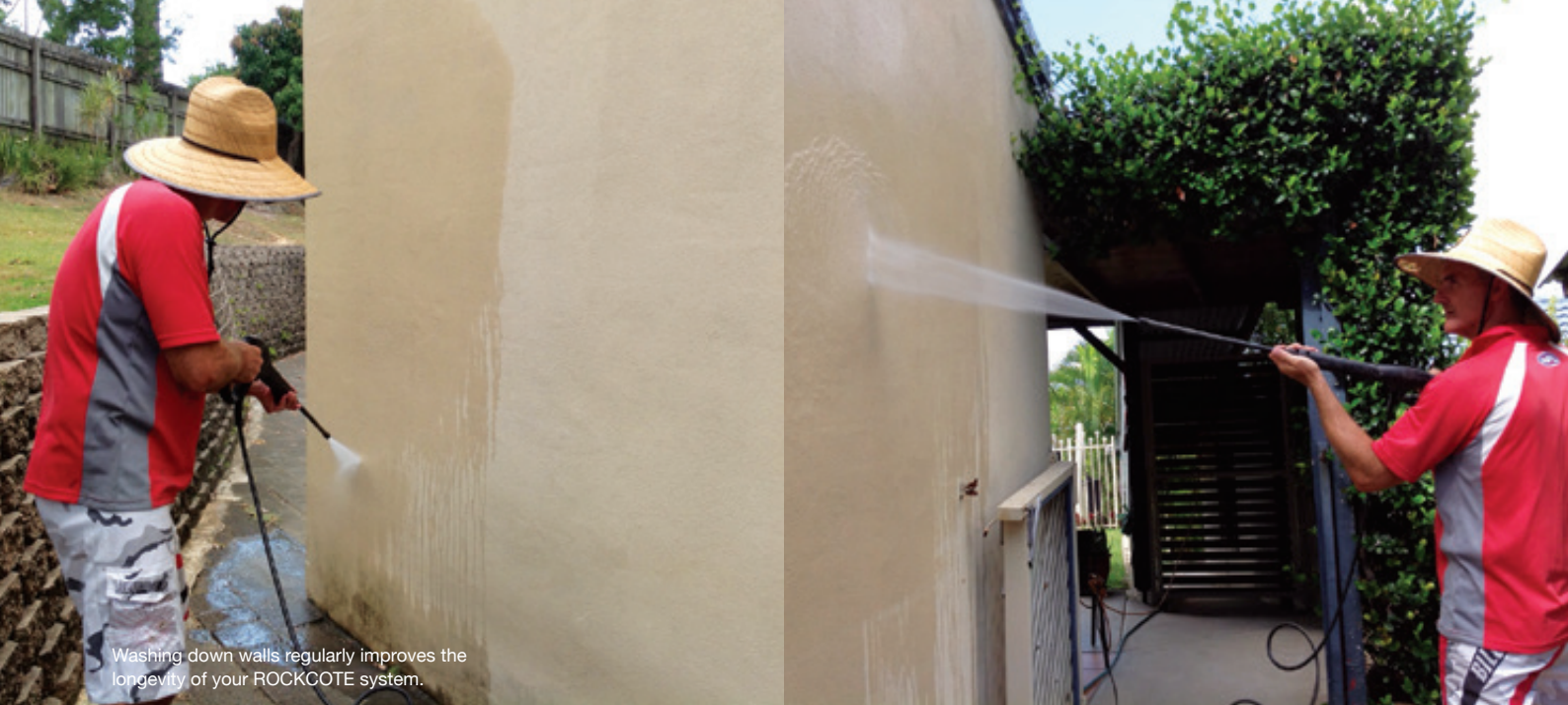
Washing down walls regularly improves the longevity of your ROCKCOTE system.