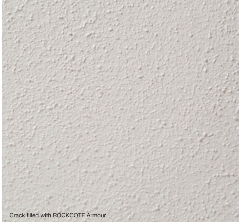
Crack filled with ROCKCOTE Armour