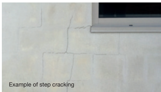
Example of step cracking