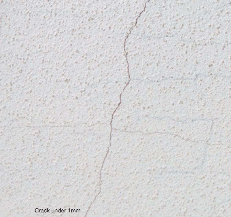
Crack under 1mm