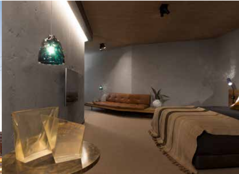
Nishi Building Canberra Applicator: Paul Geach