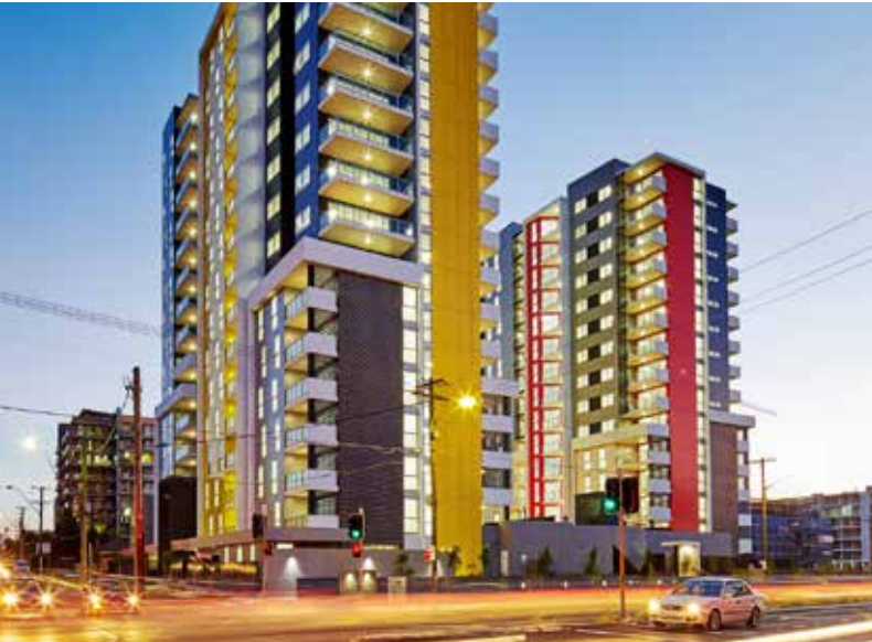
Solis Apartments