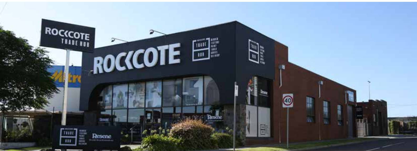
Rockcote Victorian Trade Hub, located at 400 Keilor Road, Niddrie.

Each Trade Hub is designed to support industry professionals with the resources and expertise they need.