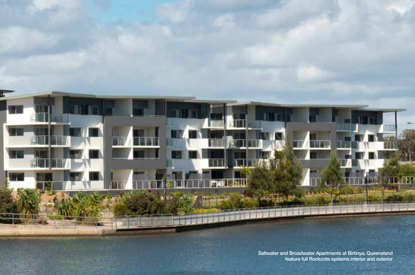
Saltwater and Broadwater Apartments at Birtinya, Queensland feature full Rockcote systems interior and exterior